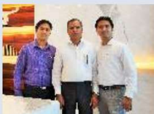
Hitesh D Suthar Devilal Suthar Hemant D Suthar Page No. 81