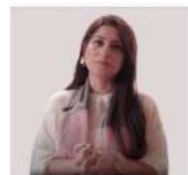
Gagan-deep Page No. 47