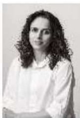
Ar. Devanshi Page No. 21